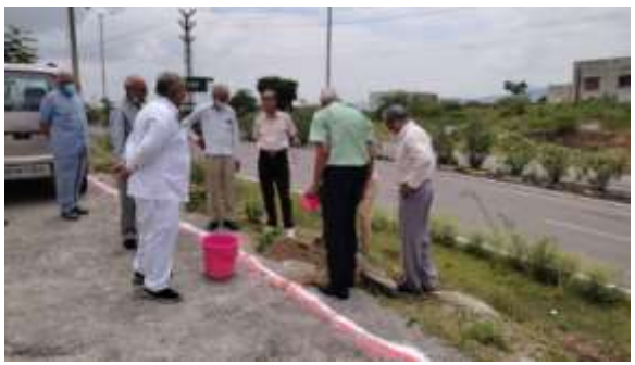
Plantation by Sh N S Khamesra.