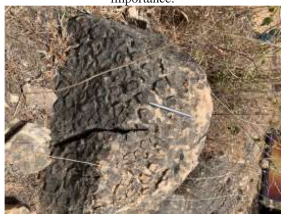
Outcrop showing excellent preservation of Bojunda Stromatolite

It is requested to kindly take up the matter with concerned authorities and ensure protection of this site of national importance.