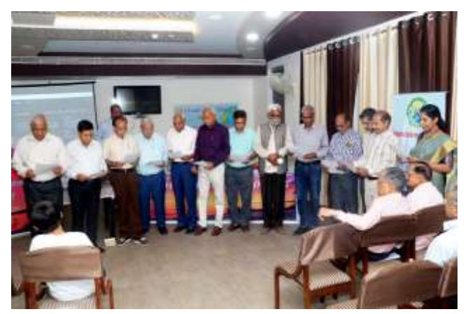
Swearing in & Oath-taking ceremony of newly elected executive body of the Geoscientists Society of Rajasthan for the year 2022-23 to 2023-24